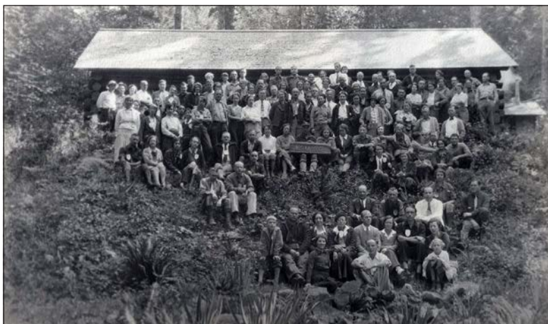
1936 FWOC Convention in the old Nesika lodge