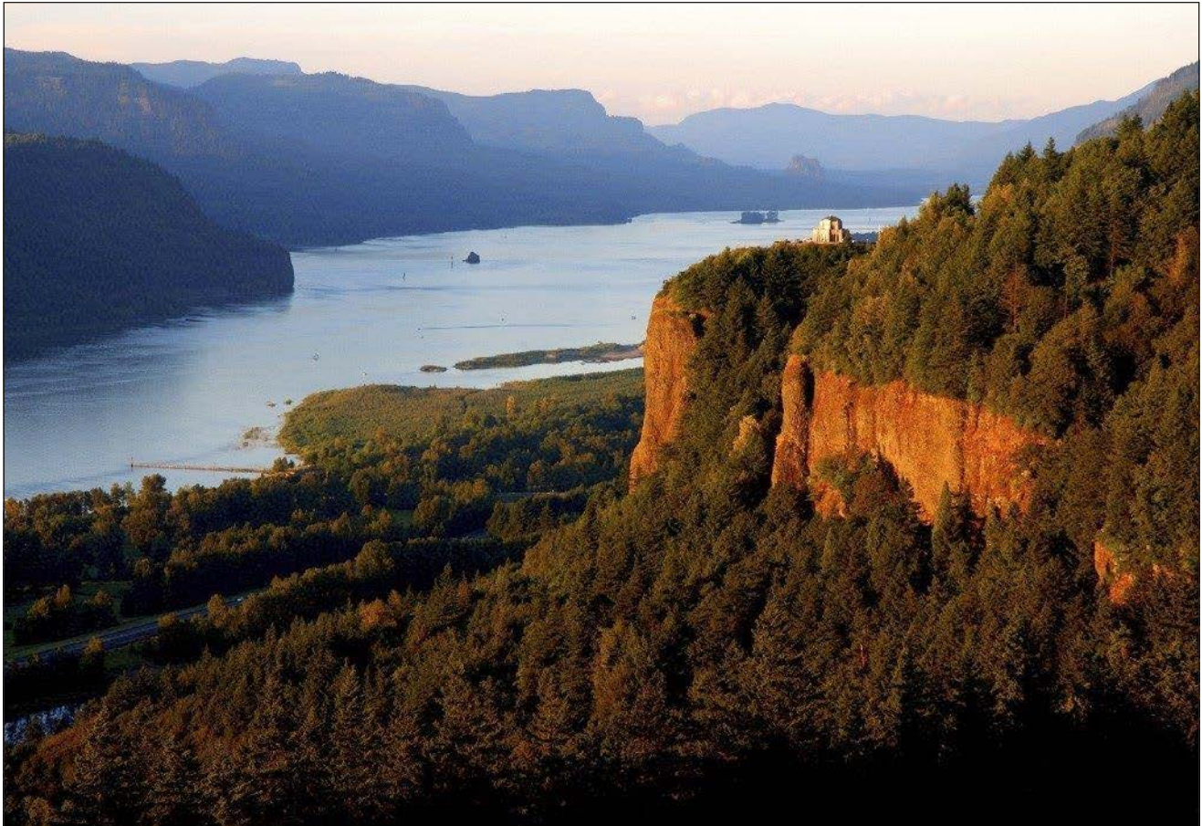
Columbia River Gorge