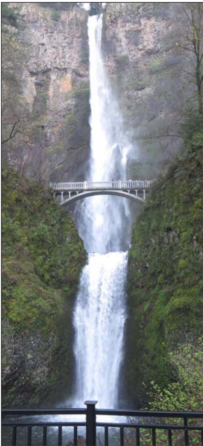
LEFT: Multnomah Falls

at the Menucha Retreat Conference Center, Corbett, Oregon