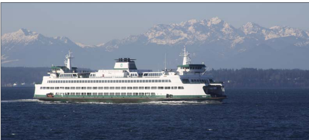
Ferry crossing Puget Sound to Bainbridge Island and Olympic Mountains

I'm looking forward to hosting you at IslandWood.