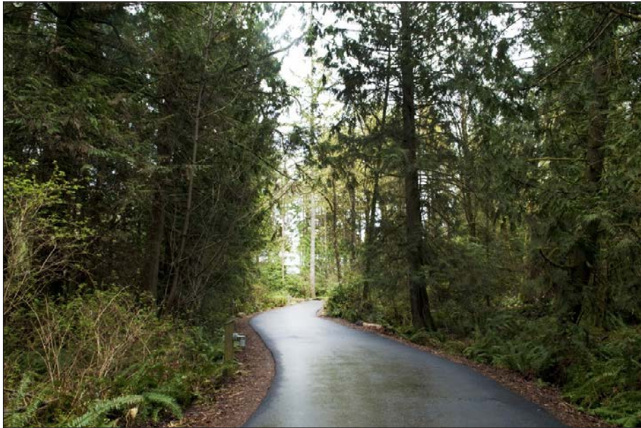
Walking path at IslandWood